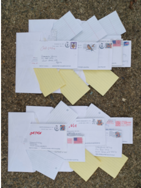
Reply letters written by volunteers | re/vision program