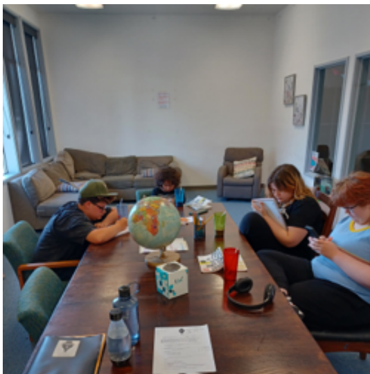
August 2023 Workshop